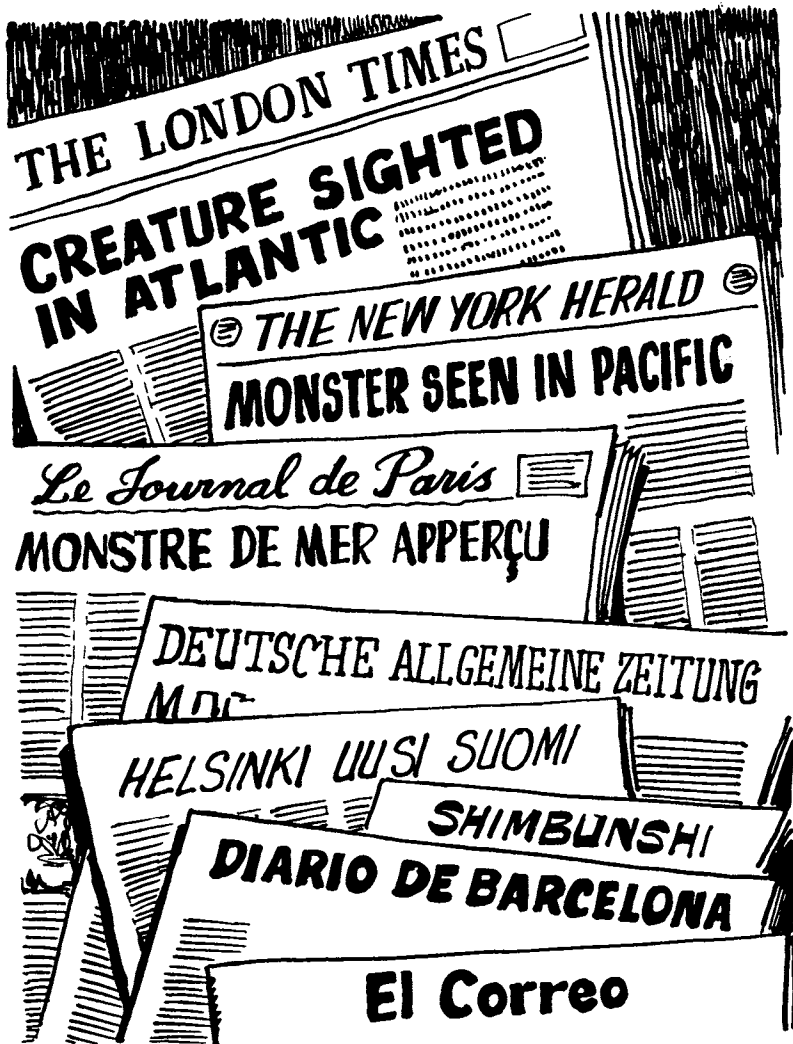
Newspaper Stories Around the World