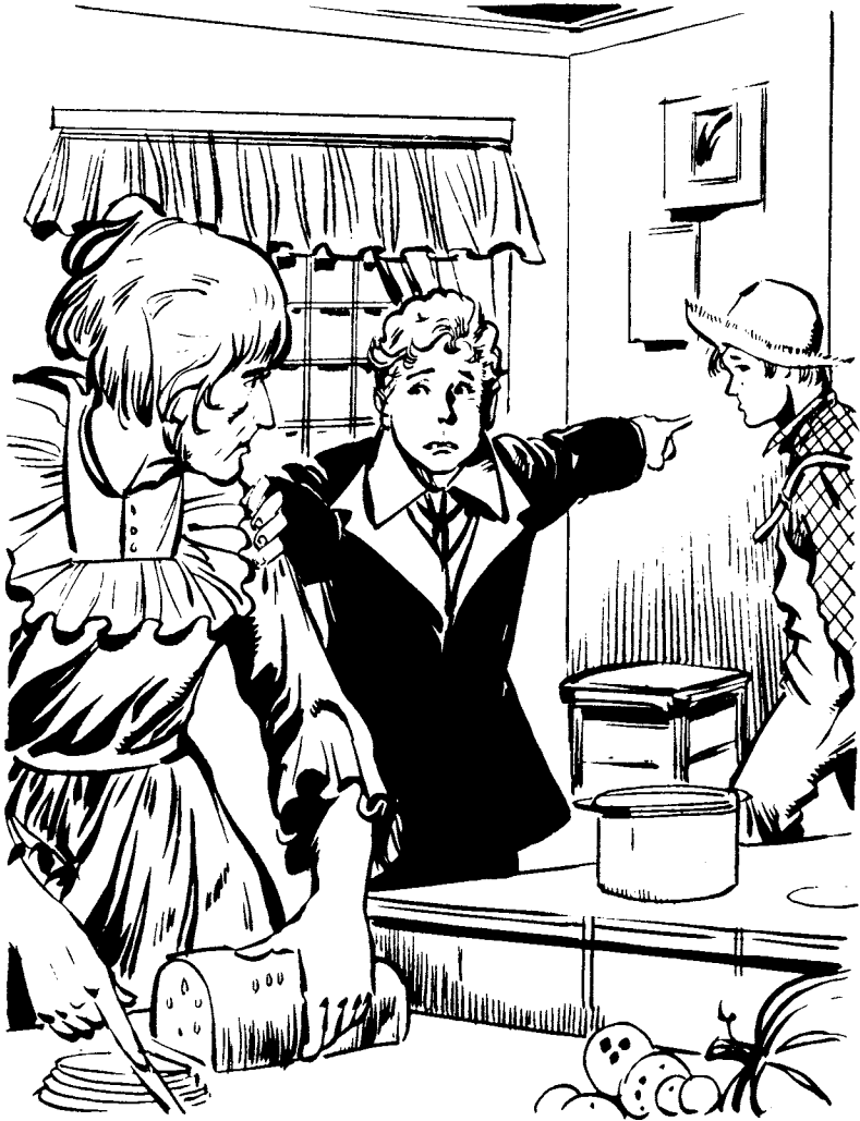
Sid Tells About Tom's Mischief.