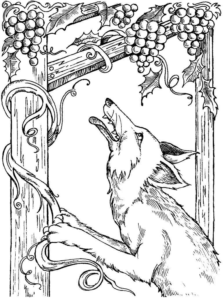
They Were Just Out of Reach.