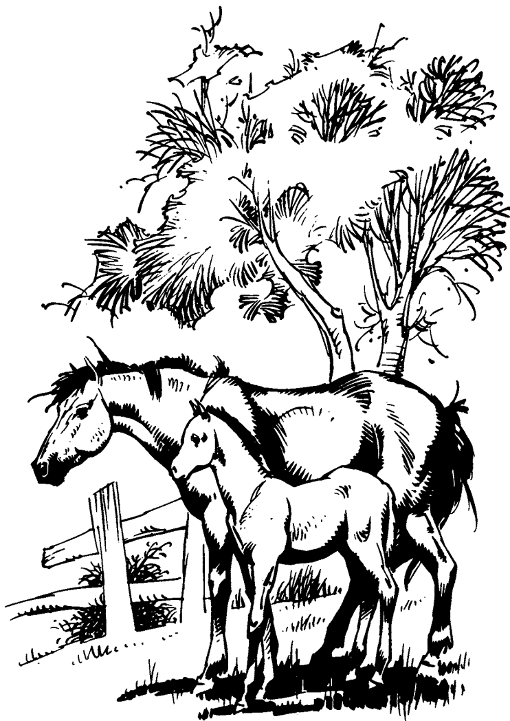
In the Shade of the Trees