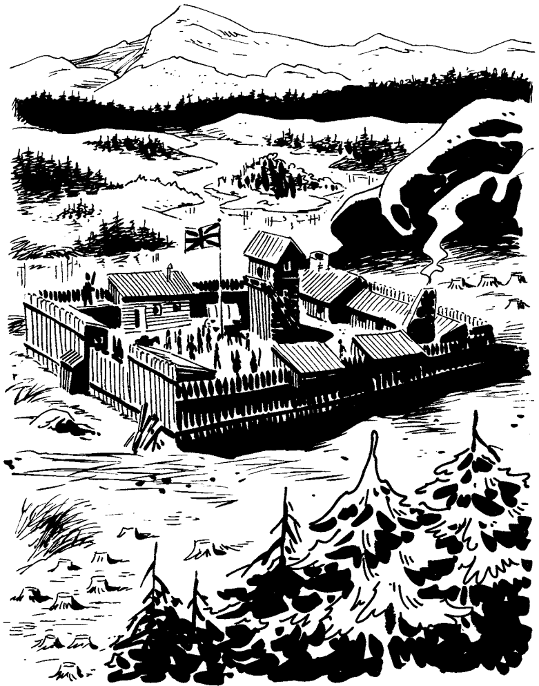
A British Fort Along the Battle Route