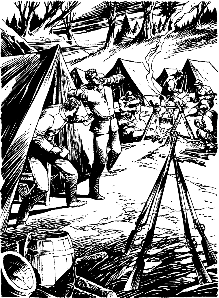
Two Close Friends Wake Up.